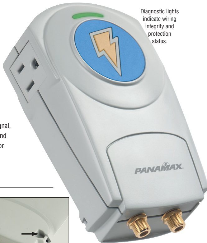
Diagnostic lights indicate wiring integrity and protection status.

The CATV surge protection circuitry ensures a clean, clear signal. It features solid-state components for maximum protection and reliability. The bandwidth and clamping level are optimized for standard cable or off-air TV signals.